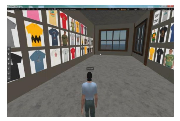
Figure 2. User interface for virtual t-shirt store. The avatar simulates the user while he or she wearing the EEG headset. The t-shirts are randomly arranged and displayed on the walls. Users can choose any Tshirt by clicking on it. The user can try any T-shirt and view himself from different angles and distances, zooming in and out. During these interactions, the emotions of users will be captured by a wireless EEG headset.

Fig. 2 shows the user interface for a virtual t-shirt store powered by an open-source project OpenSimulator (www.opensimulator.org) which aims to provide a 3D virtual environment for people at any age. The t-shirts are randomly arranged and displayed on the walls of the virtual store. Users can click on any t-shirt, trying it on and interacting with it by viewing from different angles and distances, zooming in and out, etc. During these interactions, the emotions of users will be captured by a wireless EEG headset.